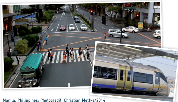
Manila, Philippines