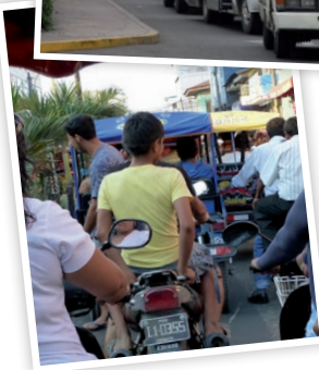
Iquitos, Peru; Lima, Peru